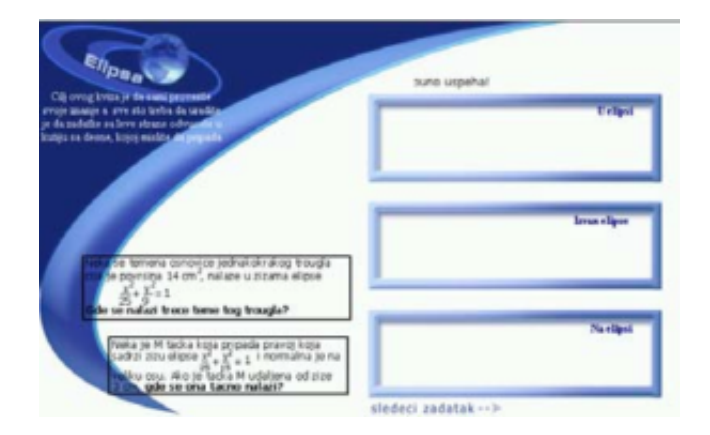
Figure 1. Multimedia ellipse: home page and interactive quiz page

As regards the above listed multimedia project requirements (3)-(6), (3) and (4) were much easier than (5) that was much easier than (6). Requirements (3) and (4) — dealing with the underlying structure and applications of the chosen topic — were more or less implemented in 11 developed artifacts. Some kinds of different learning paths were implemented in 8 artifacts (intuitive and theoretical approaches, two solutions of a task, two ways of introducing a concept). Only 2 artifacts tried to respect the P/C requirement (determining a position using the concept of hyperbola, procedural/conceptual quiz questions). However, having in mind the subjects' experience and relevant prior knowl- edge as well as the subtlety of the proceduralo-conceptual issues (cf. Haapasalo & Kadijevich 2000, 2003), the project can be considered successful (see Kadijevich 2002). Four screenshots concerning one of the best develop artifacts are presented in Figures 1