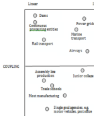
Figure 3: Complexity Coupling Relationship Kuro wicka, D. (2014)